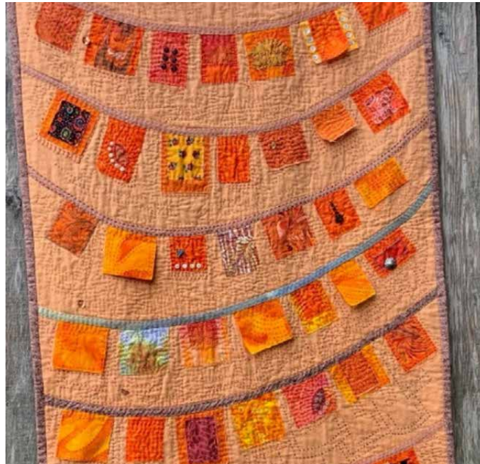
Orange shirt banners hanging in the UCC and Christ Lutheran Church in Ferndale.