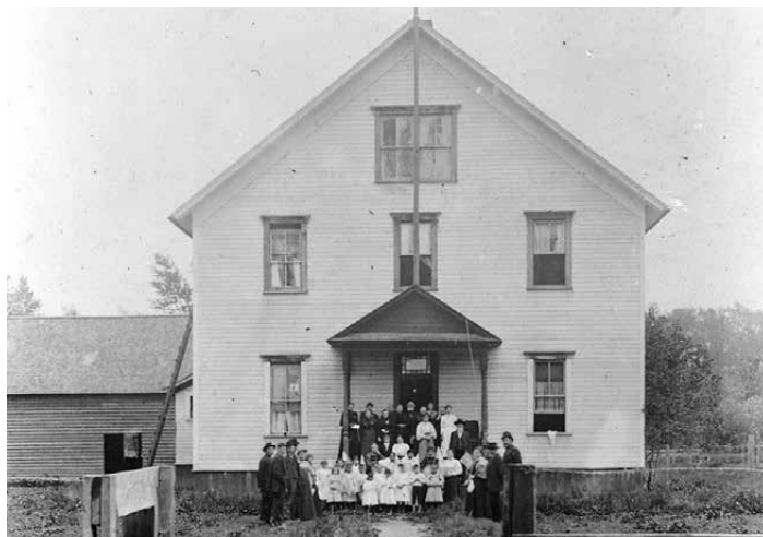
Stickney Indian Boarding School in Whatcom County was supported by the Methodist Episcopal Church’s Women’s Home Missionary Society from 1889 to 1913.

After graduating from Washington State University in 1967, she worked as a teacher before marrying and starting her family. In 1978, she received a master’s studies in library science at the University of Washington. She worked 22