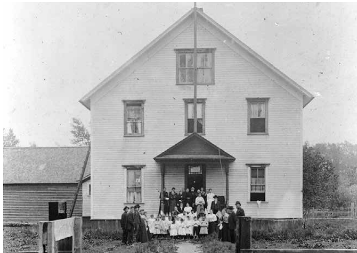
Stickney Indian Boarding School in Whatcom County was supported by the Methodist Episcopal Church's Women's Home Missionary Society from 1889 to 1913.

After graduating from Washington State University in 1967, she worked as a teacher before marrying and starting her family. In 1978, she received a master's studies in library science at the University of Washington. She worked 22