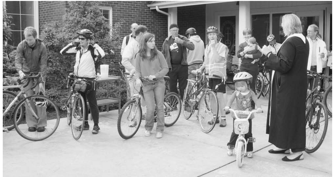
Some of more than 20 Bellingham UCC members who rode bicycles to church in May.

When members record trips on the Smart Trips website, not only can they chart their own