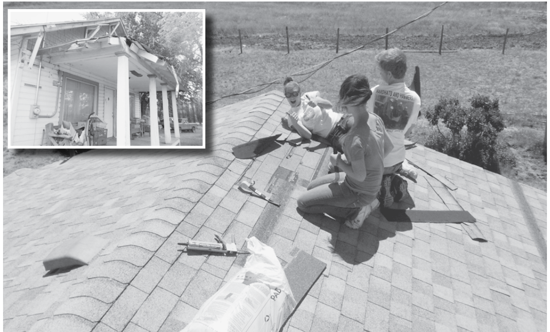
Wesley United Methodist youth help repair wind damage to roof of one house.

The owner of that home cannot afford a loan, so to have a roof overhead by winter, volunteers are needed to rebuild. A lack of summer volunteers to help rebuild has caused five other low-income homeowners