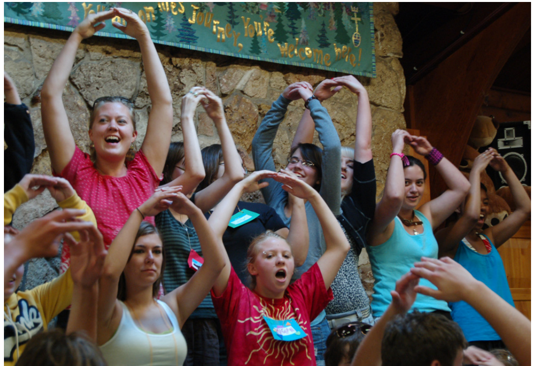
Senior high campers at Pilgrim Firs engage in song with motions.

"We created a Family Camp of about 35 folks—ages four to 90 years—who sang, studied, crafted, recreated, played, prayed and cared for one another in compassionate, faithful ways. We left grateful for this 'jewel' of an intergenerational camping experience that embraced families of