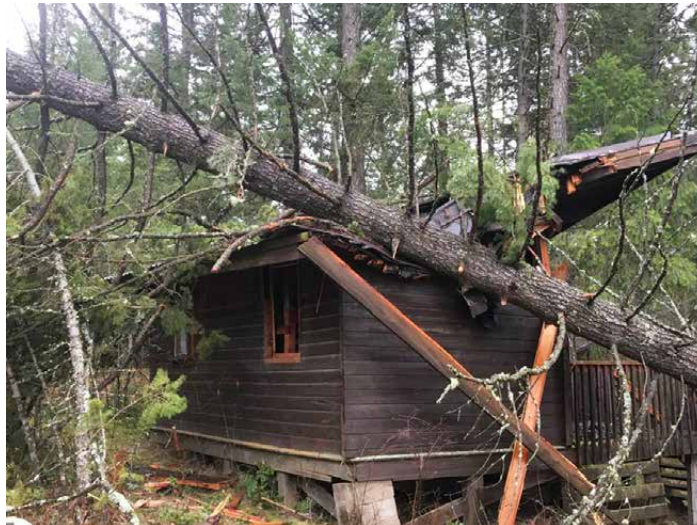
Red cedar knocks cabin 8 off its foundation, twists structure.

"We are doing cleaning and repair projects we have