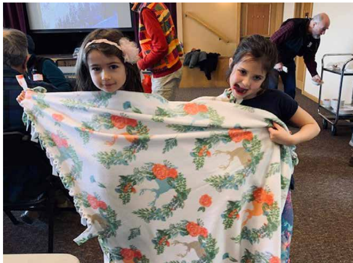
Girls prepare blankets for children in Project Linus.