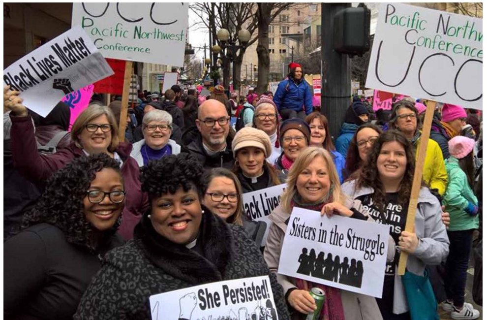
Members of the PNC Board and others from the PNC participate in Women's March.