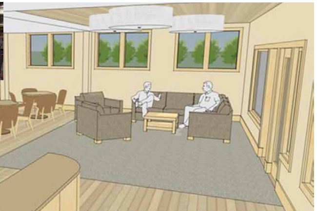
Bellingham First Congregational UCC renovates basement for Northwest Youth Services.