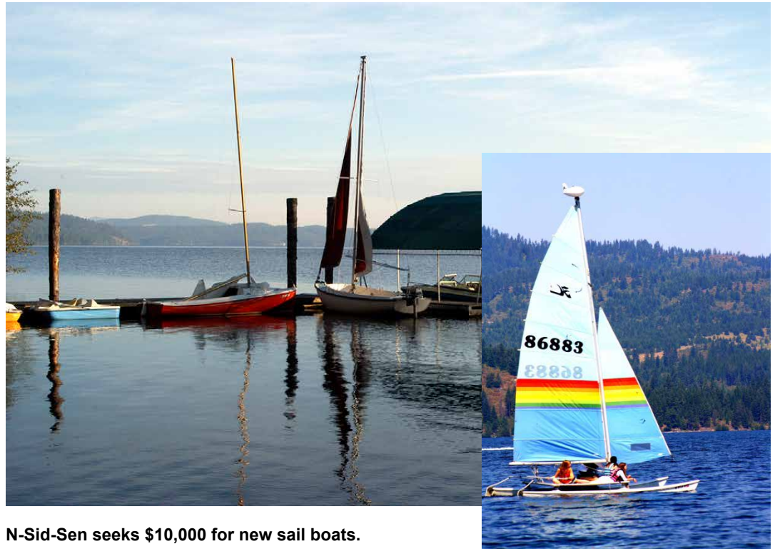
N-Sid-Sen seeks $10,000 for new sail boats.