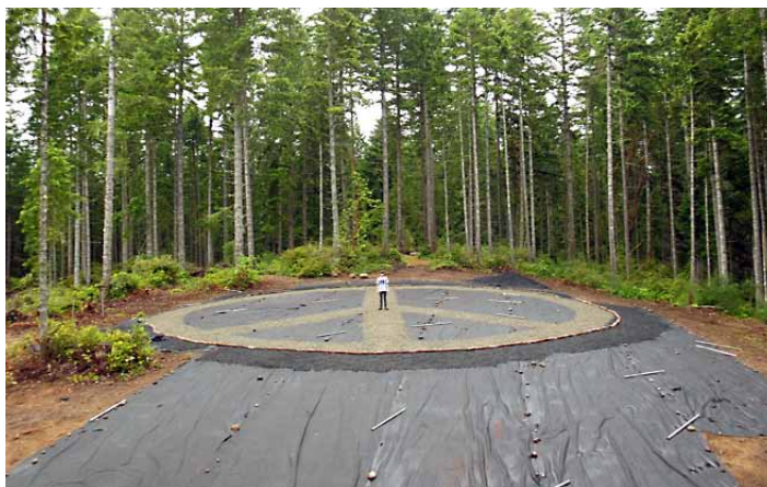
Kendall Crane from Admiral UCC stands in the peace sign at the top of the Peace GArden at Pilgri Firs.

For information, call 360-876-2031 or visit pilgrimfirs.org .