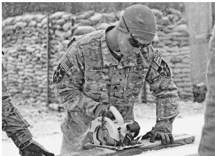
Soldiers photos are in photo galleries on Montgomery’s blog.

For information, call 253-582-1122, email gwmont@mo-comm.com or visit www.mo-comm.com/army/wordpress .