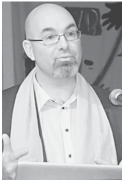
By The Rev. Mike Denton Conference Minister

Political season may be brutal. How can churches encourage civil civic and religious discourse?