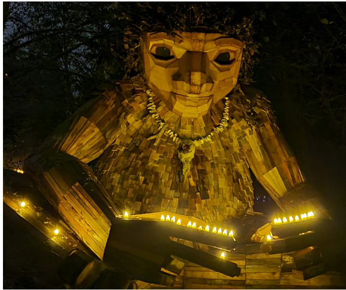
Pia the Peacemaker is a gathering point in Bainbridge Island.