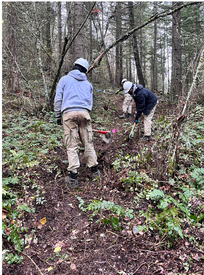
AmeriCorp team members clear trails at N-Sid-Sen.

In December they returned to Sacramento for two days before going to Eugene, Ore., where they will clear brush, make trails, and do beautification projects in parks for seven weeks, before going to Santa