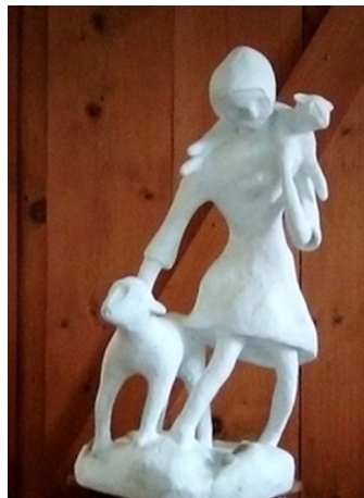
Finding the Lost

In his eight years of ministry there, he helped the church resettle about 100 refugees from Vietnam and Laos at first and later from Argentina and Ethiopia. He served during that time on the Washington State Commission for settling refugees, providing English classes and other training too settle in.