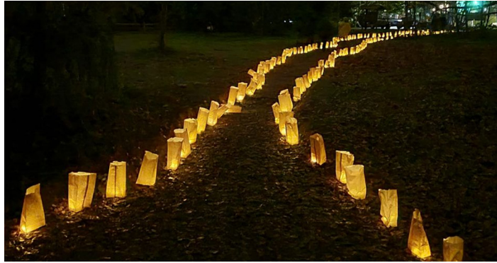
Luminaria line the path to Pia the Peacemaker for vigil.