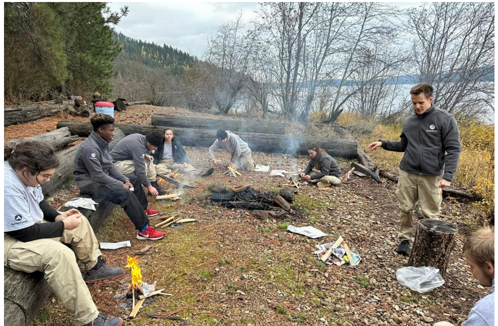
Eight of the nine AmeriCorps team helping with fire mitigation, trail clearing and beautification at N-Sid-Sen enjoy a campfire.

“At N-Sid-Sen, fire mitigation has Continued on page 4