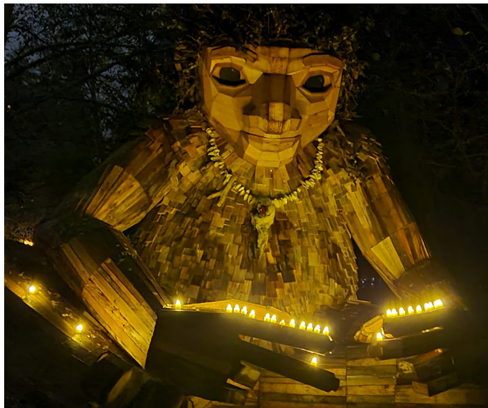
Pia the Peacekeeper is a gathering point in Bainbridge Island.