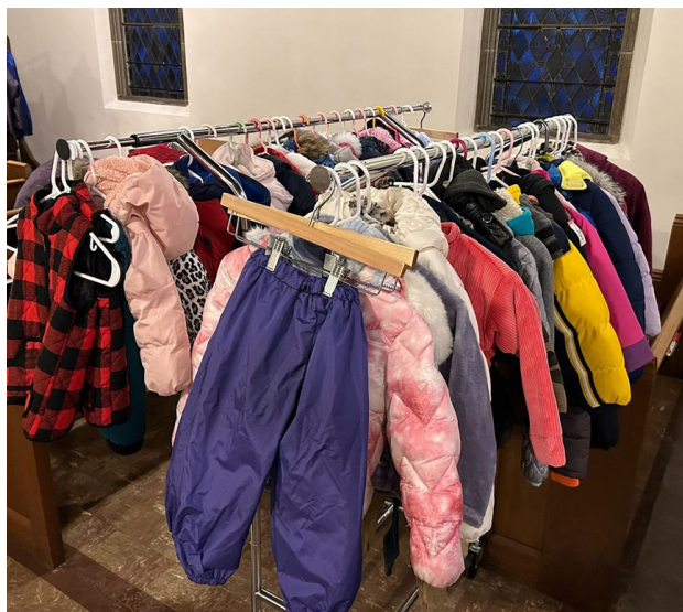
Two racks of children's winter coats and snow pants are set up for those at the food bank to choose from.