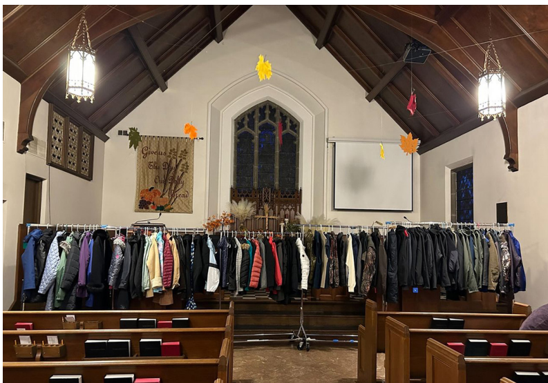
A rack of winter jackets spans the width of the sanctuary offering a wide selection for adults in need.

For information, call 425-333-4254, email tolt@tolucc.org or visit tolucc.org .