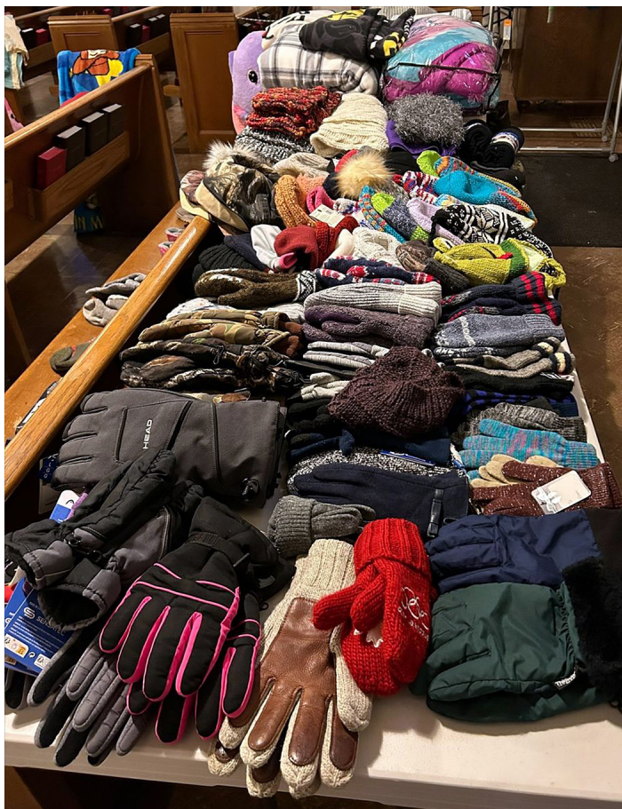
Warm gloves and hats fill a table at the back of the sanctuary.

“It have been going strong each week ever since,” she