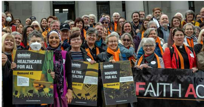
Faith Action Network Advocacy Day is Feb. 8 at Olympia,

"We advocate for policies that advance our values grounded in faith and spirituality: belonging and human dignity, justice and equity, interconnectedness, collaboration and pluralism," she said.