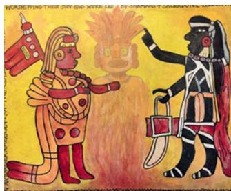
Spiritual and Other Leaders

windows originally created by children as mock stained-glass windows with tissue paper collages. When those were worn out, the church contacted him to work with members to make real stained-glass windows, primarily depicting the life of Christ.