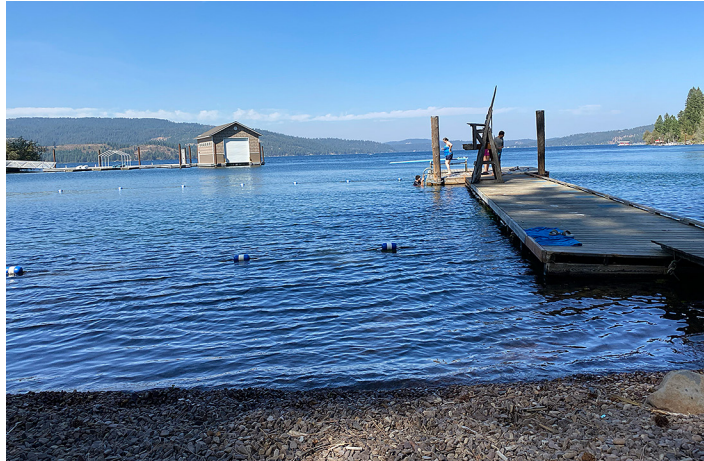
The swimming beach is in "The Cove" at N-Sid-Sen.

Camp sessions are led by approved and trained volun-