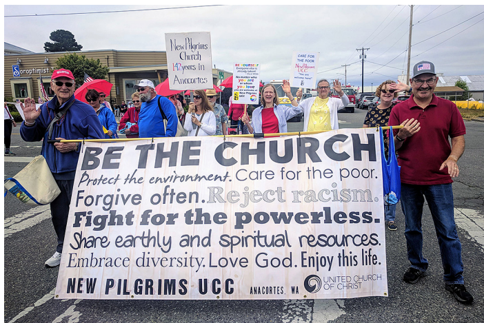
New Pilgrims UCC carried banner in Anacortes July 4 parade.

Its other outreach to the community has included A Simple Gesture Food Donation