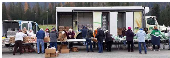
Church volunteers feed people in northern Stevens County.