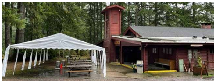
Pilgrim Firs has set up an outdoor dining area on the patio.