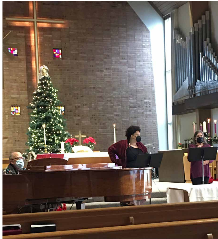
Worshipping in person began in mid June. Photo shows Everett UCC worship leaders on the second Sunday of Advent.

Everett UCC also has a small “pantry” open on the last