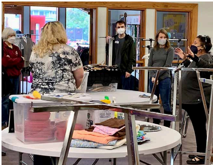
Volunteers set up clothing bank for Afghan refugees and others.