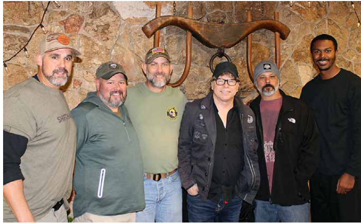
Warrior PATHH group at Pilgrim Firs joins in song writing.

"These programs use a unique blend of wellness prac-