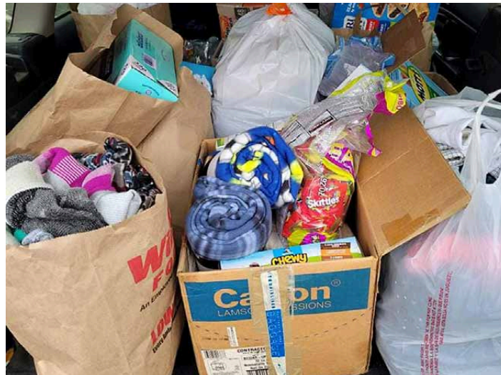
Food is brought to Chewelah from Hope Street Project in Colville.

They are also renovating buildings for housing, and some of their clients assist in the work, she said.