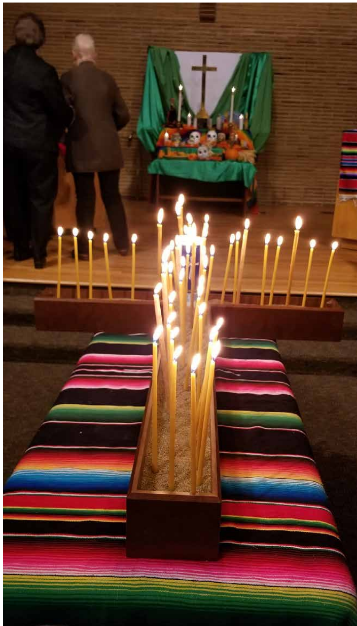
A Mexican cross with lighted candles is set on a Mexican rug on a table in the aisle.

She asked members of the churches to send her names of loved ones and she put them to the tune of "For the Healing of the Nations," which has been used to honor different coun-