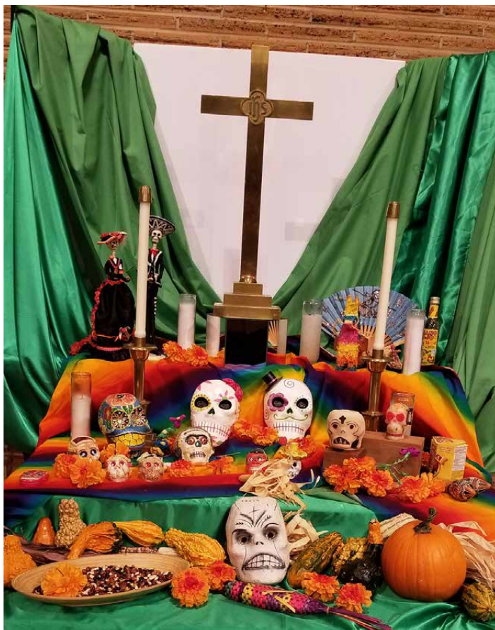
Day of the Dead altar setting.

"All Saints and All Souls Day evolved into celebrations that today honor the dead with