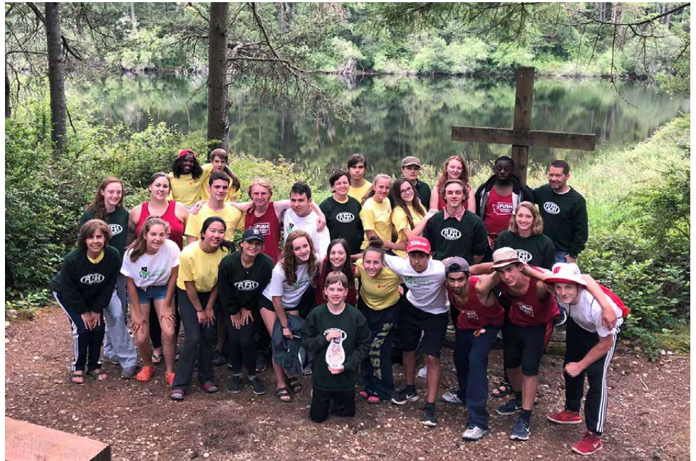
Members of a team of youth from 9th through 12th grade from First United Church in Oak Park, Ill., were first Common Fire mission/service campers.