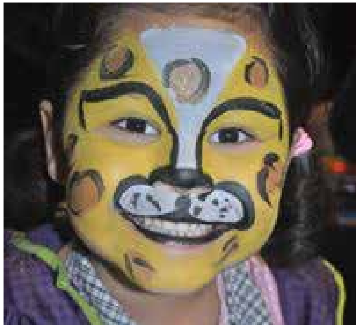
Girl with face painting at the Harvest Festival for Spanish-speaking voters with translation into Spanish.

For information, call 509-371-8000 or email shalom@shalomunitedchurch.org .