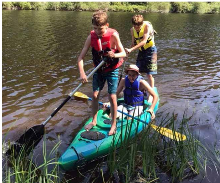
Fun on the lake is part of the day.