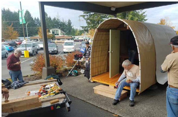
At the fall workshop, participants built a Conestoga house.