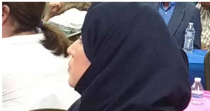
Woman at the Islamic Center of the Tri-Cities listens.