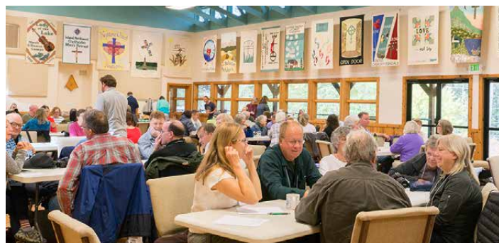
Small groups share lives and visions.