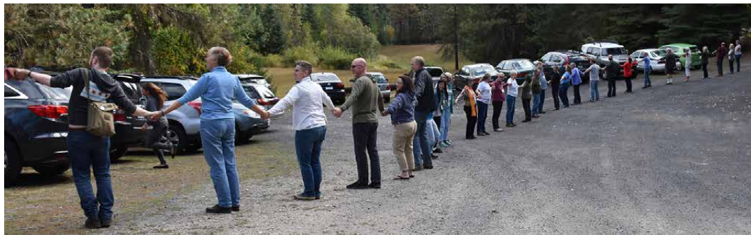
Fall Gathering participants form a human chain from lodge reaching into N-Sid-Sen parking

"to love God with all our heart, soul, mind and strength and to love our neighbor as ourselves," she pointed out that "first, we need to love ourselves. Then, we need to know our neighbor to love our neighbor, the inner life of who they are, their hopes and dreams, so we love them as they need to be loved, not just do nice things," she said.