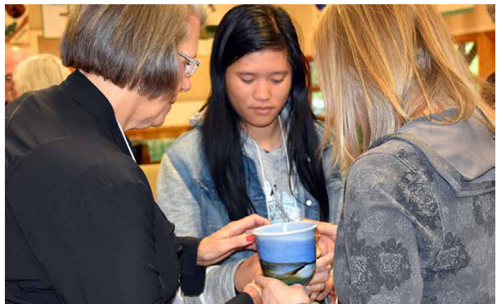
Sharing communion with each other in small groups.

petroleum-based society," she said, frustrated that millions gain access to health insurance but complain it's not perfect, or that Washington and Oklahoma are having a hard time funding public education.