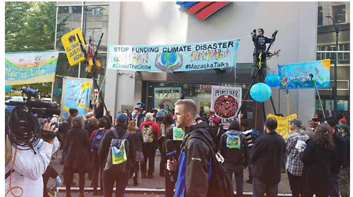
Larger group protests with signs at Bank of America.