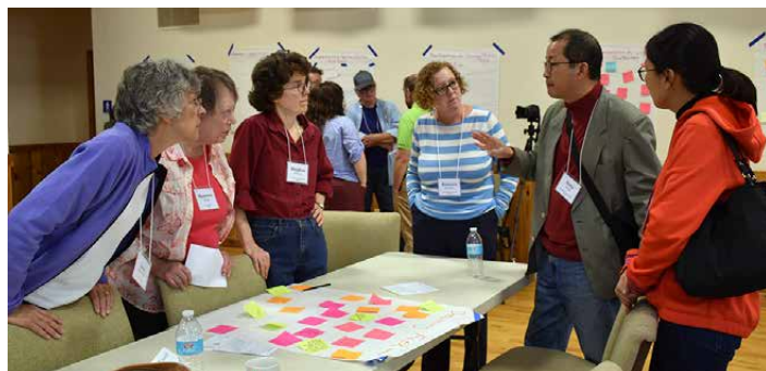
Larger group synthesizes ideas shared on sticky notes.