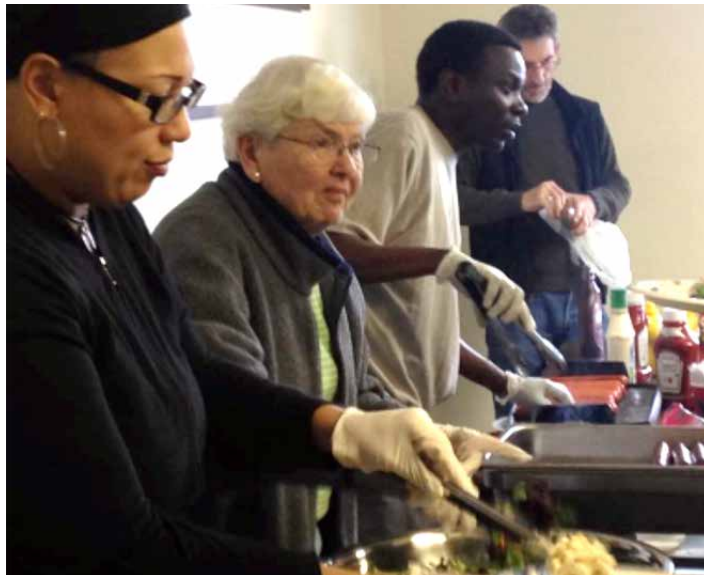
REACH volunteers serve supper to homeless people.

Latter-day Saints missionaries cook hotcakes for Warmup