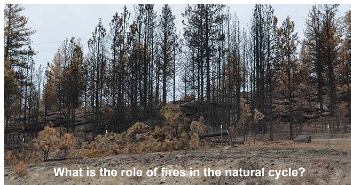
What is the role of fires in the natural cycle?