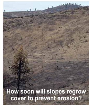
How soon will slopes regrow cover to prevent erosion?