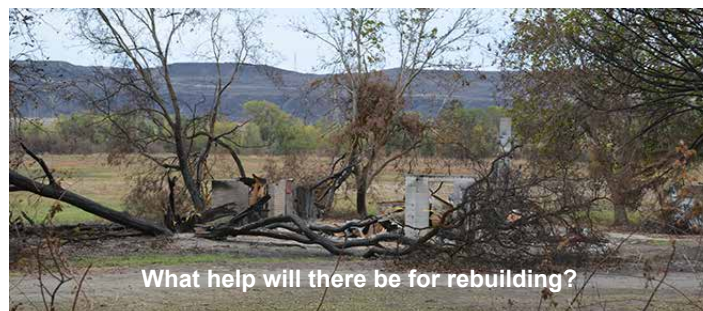
What help will there be for rebuilding?