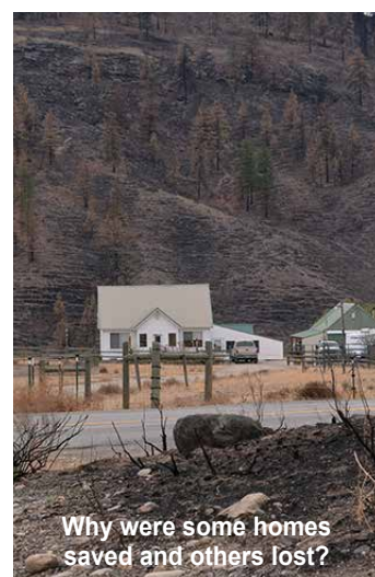
Why were some homes saved and others lost?