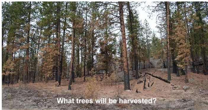
What trees will be harvested?

Governor Jay Inslee's request for assistance said 522,920 acres were burned in the Okanogan Complex, Tunk Block and North Star fires (Okanogan Complex), com-