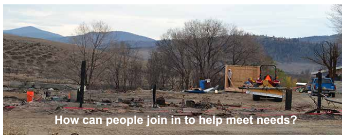
How can people join in to help meet needs?

pared with 256,108 acres in the Carlton Complex. People are still searching for housing from that fire, which destroyed 237 homes and 53 outbuildings.