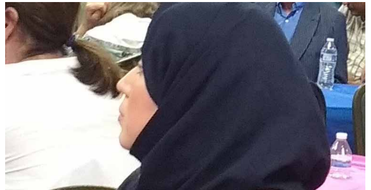
Woman at the Islamic Center of the Tri-Cities listens.