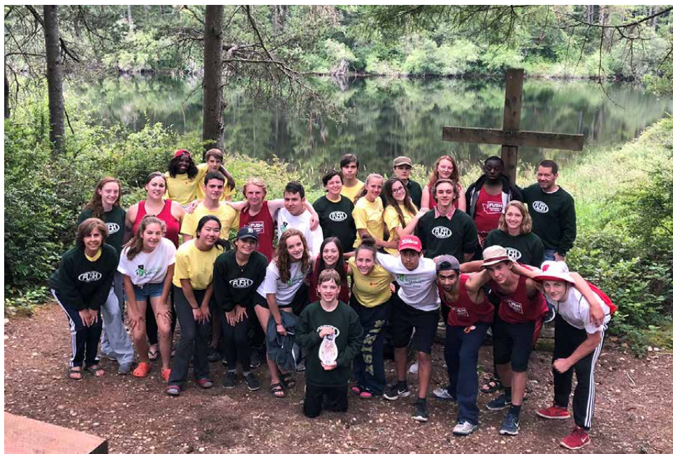
Members of a team of youth from 9th through 12th grade from First United Church in Oak Park, Ill., were first Common Fire mission/service campers.