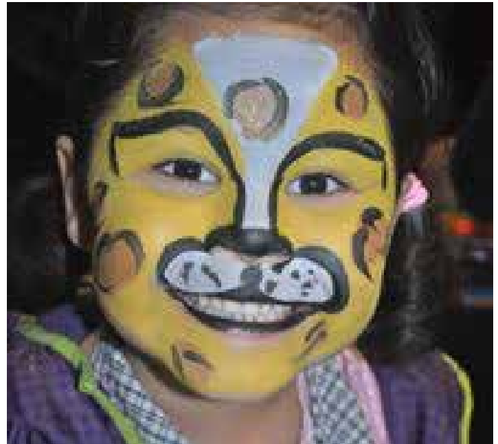
Girl with face painting at the Harvest Festival for Spanish-speaking voters with translation into Spanish.

For information, call 509-371-8000 or email shalom@shalomunitedchurch.org .