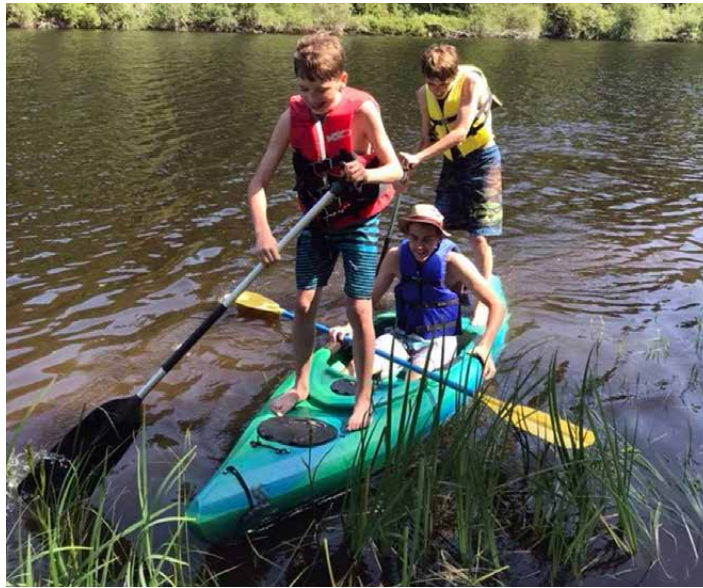
Fun on the lake is part of the day.