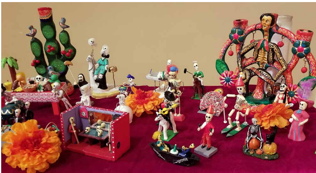
Day of the Dead memorabilia Kay Groves has collected over many years.

altar with decorative skulls to represent the vitality of life of beloved people who have died, bright colored paper and fabrics