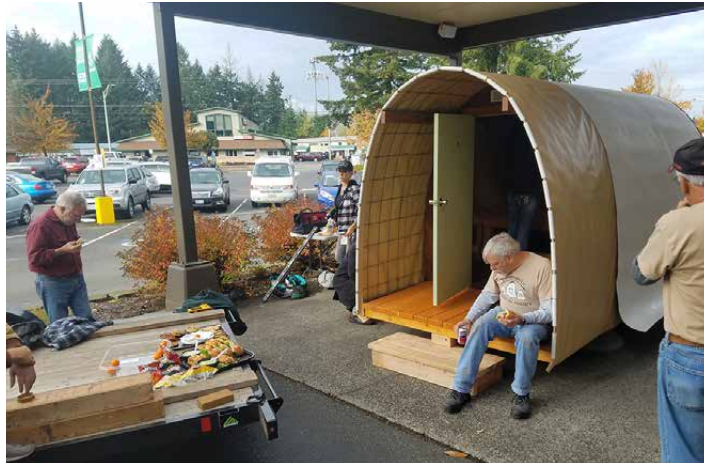
At the fall workshop, participants built a Conestoga house.