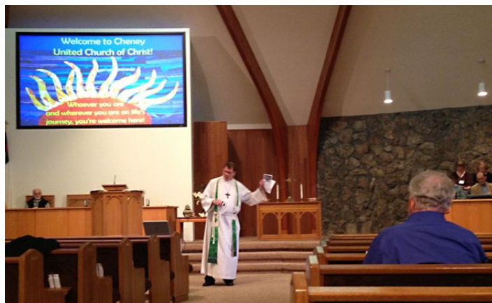
Cheney UCC's projection system was ready for use by Christmas.