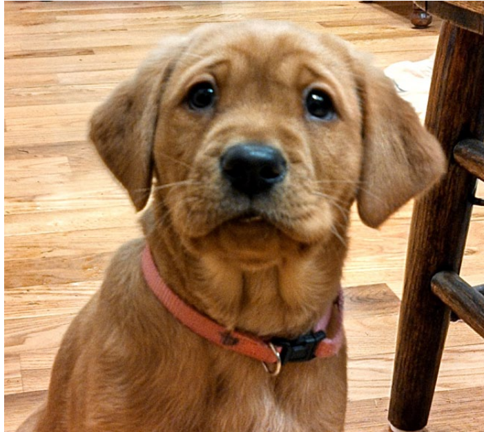
N-Sid-Sen's new camp dog, Sage, is excited to welcome campers to camp.

In mid-February the registration for the Midwinter Youth