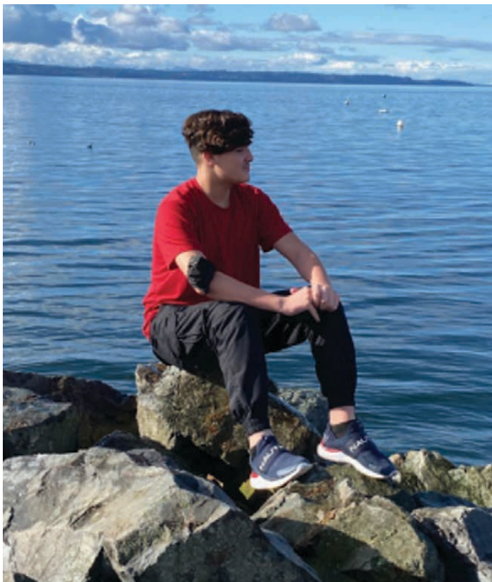
Oldest son appreciates view of Puget Sound.

For information, call 425-361-6499 or email donna-jleggett@gmail.com .