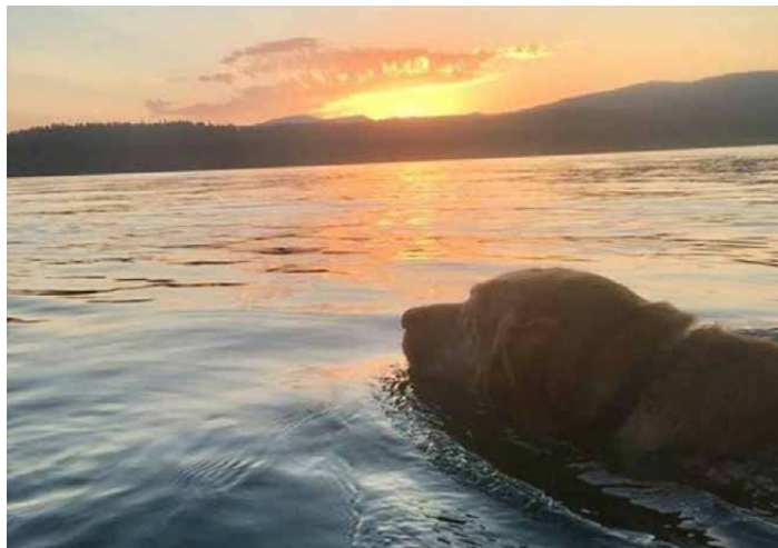
The camp dog, Sage, swims in the sunset at N-Sid-Sen.

"Campers and leaders live, work, play and worship from