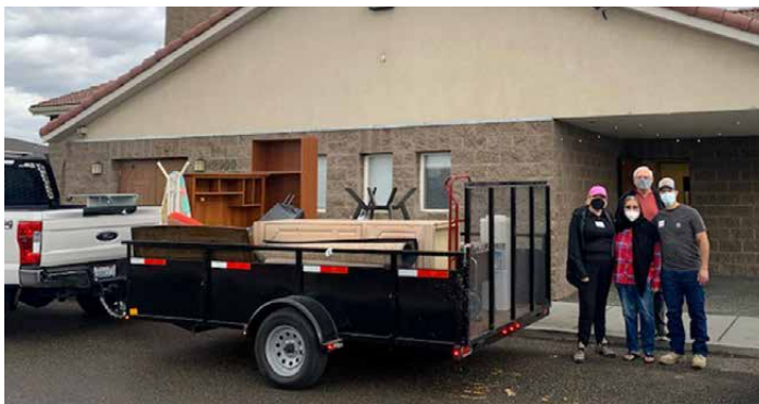
Volunteers load furniture for Afghan refugees in Tri-Cities.

office. The potential donations are entered onto the spread sheet then matched with families' needs.