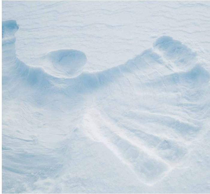
Lenten snow angel sets theme for stories of hope.

Time away from my paper, a warm cottage pie, and encouraging words from my room-