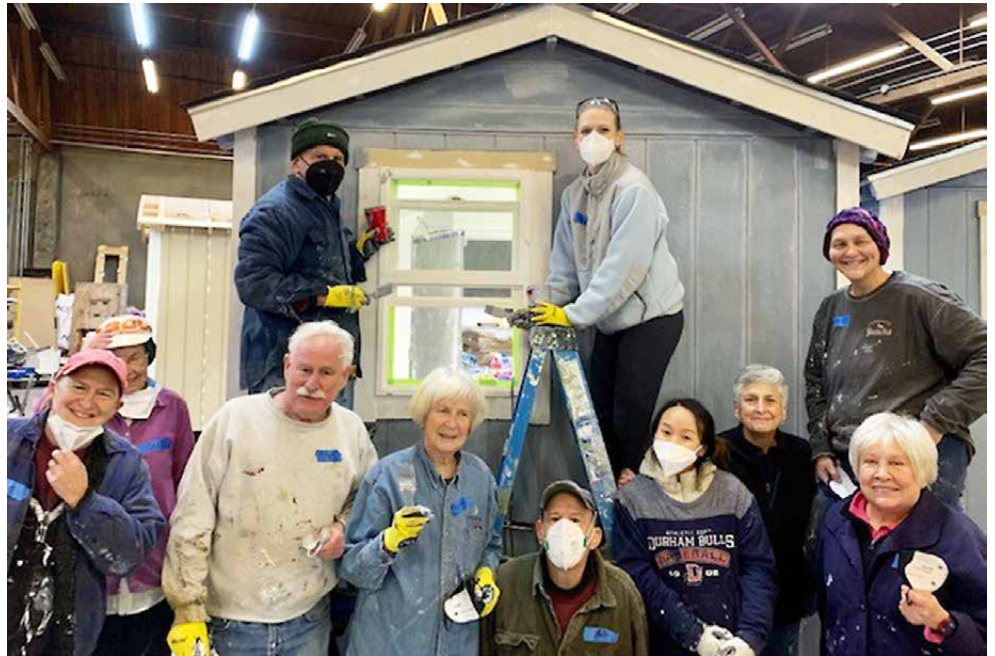
Building team from Magnolia UCC helps build a tiny house, one way to address homelessness in the Seattle area.

For the first session on homelessness Continued on Page 4