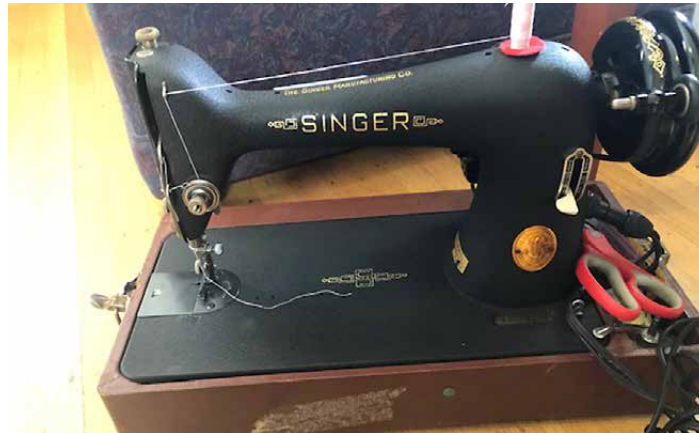
Volunteers found sewing machine used by Irish immigrant.

"We began talking with each other as the national UCC was encouraging churches help