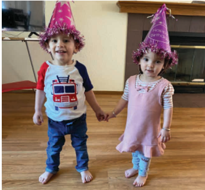
Afghan refugee twins celebrate their second birthday

The family of 10—two parents, four boys and four girls