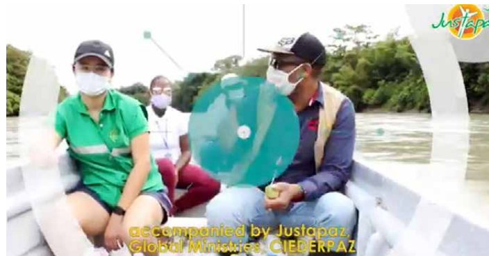
Photo from the Justapaz video shared as part of the September 2020 Peace Pilgrimage.