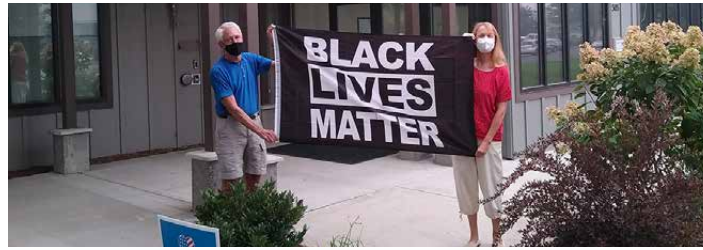
Shalom UCC in Richland top, and United Churches of Olympia join in calls for racial justice and dismantling racism, below.

She was awakened to the concern taking an Undoing Institutional Racism class during a year in the Jubilee Justice program. In addition, Plymouth UCC in Seattle, where she has been a member since 2018, is also discerning how to be an